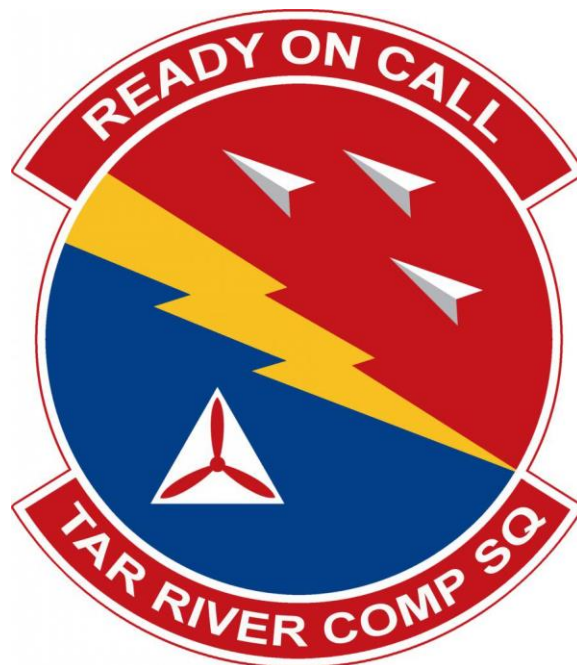
Sample - actual size

For a unit's scroll (s), use any color as long as the overall design has six or fewer colors and the border of the disc and scroll (s) are the same color as the letters on the scroll.