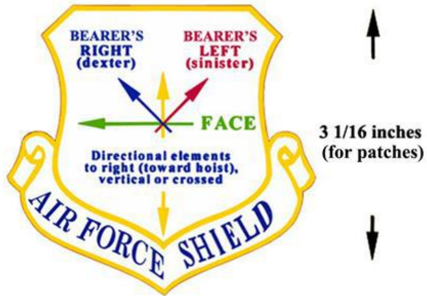
Figure 1. Shield Design Format and Example of Emblem for Groups and Above (All Flag Bearing Organizations)